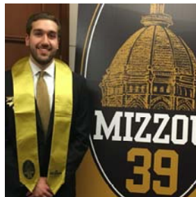
Former Dragon Named One of the...