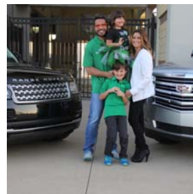
I Sell Cars, Why Didn't My Wife Bu...