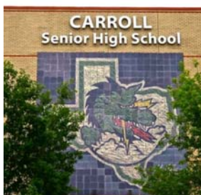
Carroll Senior High Named One of Am...