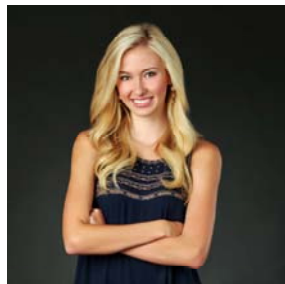
Five ones to Watch In 2016: Jessica B...