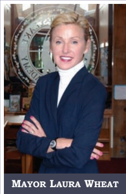
MAYOR LAURA WHEAT