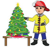
Remember Fire Safety

As we grow closer to the holiday season, many of you may place a Christmas tree in your home. Our awareness of fire safety is crucial during the holidays. Many fires are started by placing Christmas trees too close to heat sources such as the fire place, candles, or heaters. Make sure you inspect your tree lights for shorts, frays, or exposed wiring as this is also a cause of fires. And please remember, NEVER leave your Christmas tree lights on while sleeping or when you leave the house. If you have a non-artificial tree, make sure to keep the tree stand full of water at all times and discard the tree when needles begin to fall easily. Practicing these suggestions will help ensure safer holidays for you and your family.